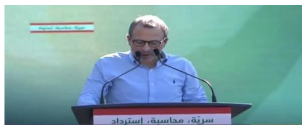
Figure 4 - The performance's green background and slogan